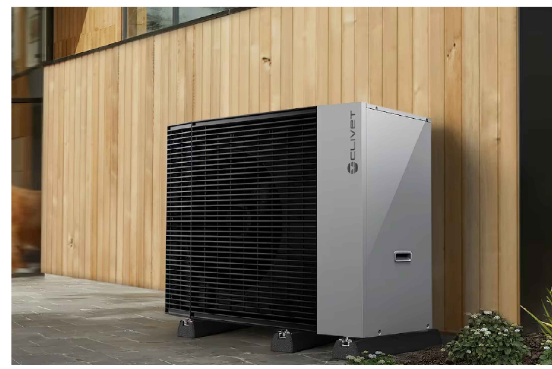
Example Installation of Proposed Clivet Edge Pro ASHP